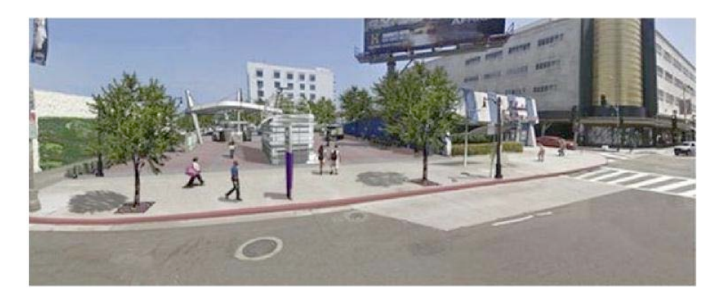
Illustration of a possible design for the Johnie's Portal.

The crucial factors Metro cited in recommending the Johnie's portal are: